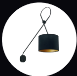
MISS PR Pg 58