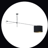
MISS PL Pg 36