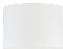
PARALUME .25 Tessuto bianco, interno bianco