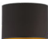
PARALUME .26 Tessuto nero, interno oro