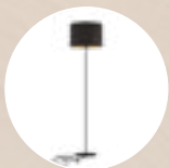
TINY PT 402