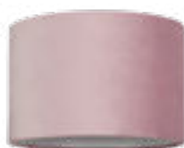
PARALUME .27 Velluto rosa, interno bianco