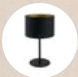
TINY TL 410