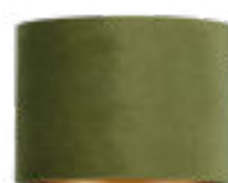
PARALUME .29 Velluto verde, interno oro