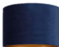
PARALUME .28 Velluto blu, interno oro