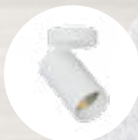
HONEY PL 368