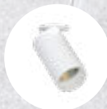
HONEY IN 370