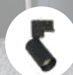
HONEY TR 514